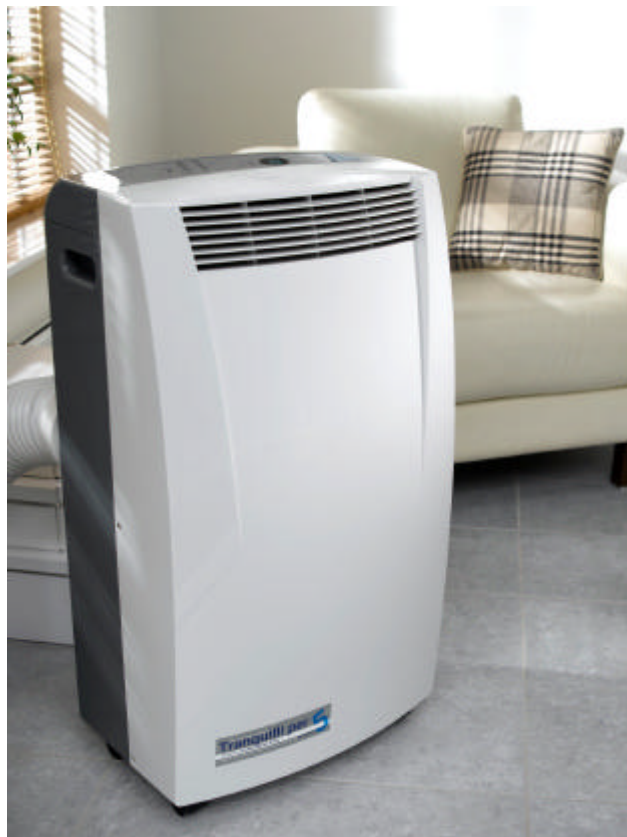
ELECTRONIC CONTROL PANEL