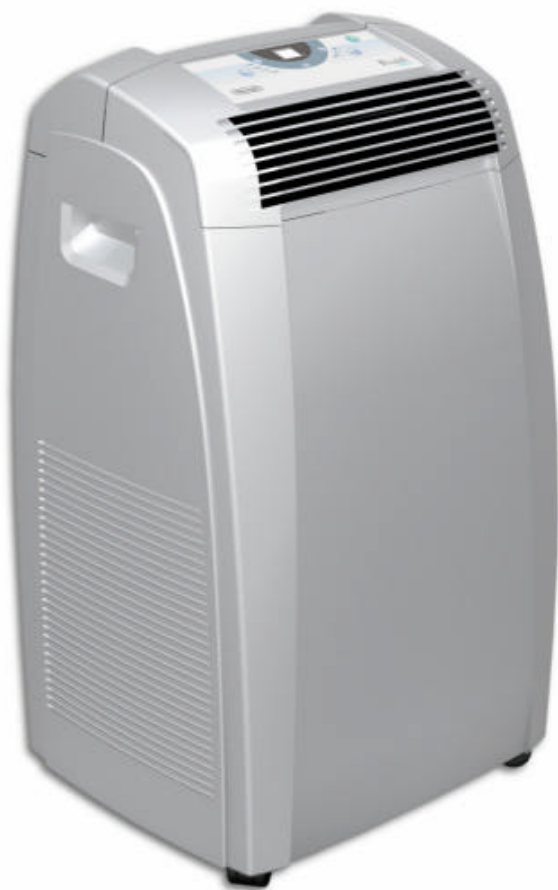
ELECTRONIC CONTROL PANEL

PAC C110 is the perfect appliance to always have the desired climate anywhere it is needed. It uses the most advanced technology to maximize its cooling capacity.